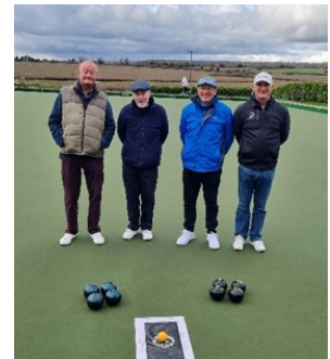
Our Final Four