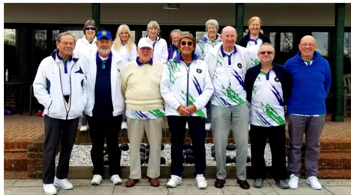
Totton & Eling Match — Team Photo